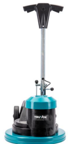
ORBIS® ECO 200 / 400 / DUO