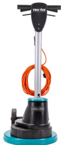
ORBIS® 200 / 200HD / 400